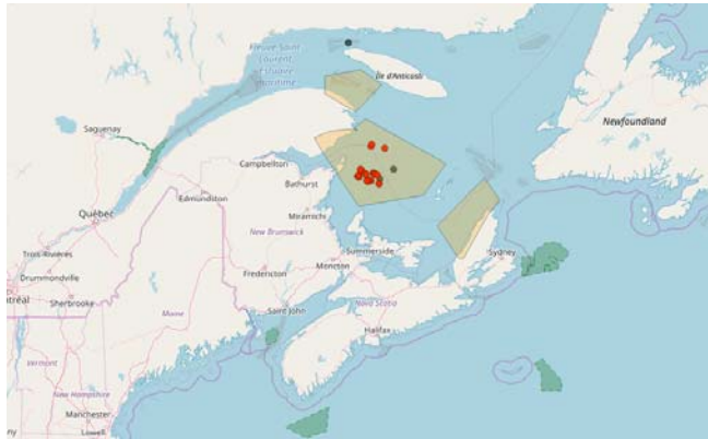
Map 2: Designated foraging areas

We also support DFO's implementation of a dynamic closure scheme. Under this scheme, if one right whale is observed inside designated foraging areas within the GSL, nine surrounding grid squares within that area are closed for 15 days from the last whale sighting. 19 We were unable to determine the full extent of the designated foraging areas. DFO's interactive map provided on its website currently depicts three foraging areas (shaded in orange in Map 2 below). 20 However, maps included with some of DFO's Notices of Fisheries Closures depict five foraging areas, including an area north of Anticosti Island. 21 DFO issued approximately 30 closures between May and October 2018, covering various fixed-gear fisheries, including snow crab, toad crab, rock crab, lobster, whelk, Greenland halibut (fixed gear), winter flounder (fixed gear), Atlantic halibut (fixed gear), mackerel (gillnet), and herring (gillnet). 22 Additionally, DFO's Maritimes Region issued a small dynamic closure in each of the designated right whale critical habitat areas in Grand Manan and Roseway Basin due to the presence of a right whale. 23